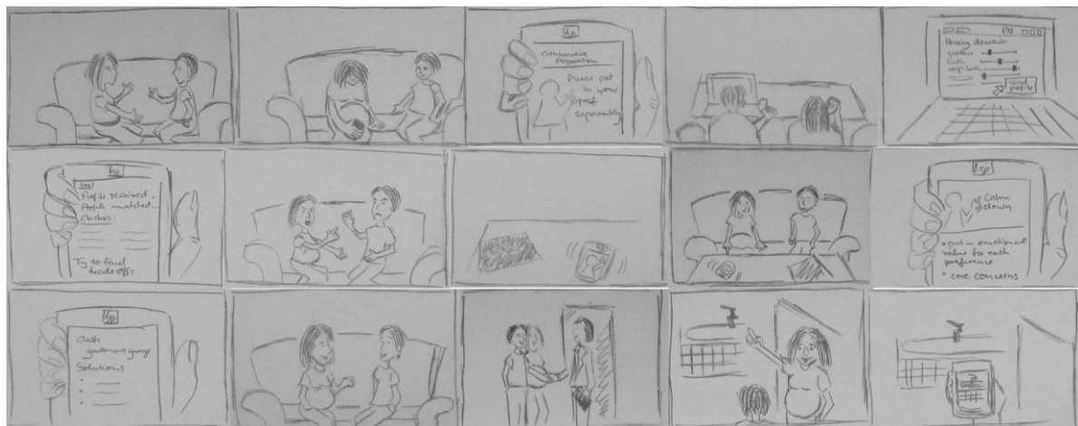
Fig. 1. Collaborative preparation scenario

Focus groups [16] have been widely used in marketing to exploit the dynamics of group discussions in order to receive attitudes towards ideas or products. Bruseberg and McDonagh-Philp [3] have shown that focus groups are also useful during the design process of new technologies. They help the participants to articulate their ideas and provide the researcher with inspiration for the design process. Lately, HCI researchers have adopted the method and refined the techniques used to stimulate the discussion. As for instance, Goodman and colleagues [7] found out, it is profitable to use visual help such