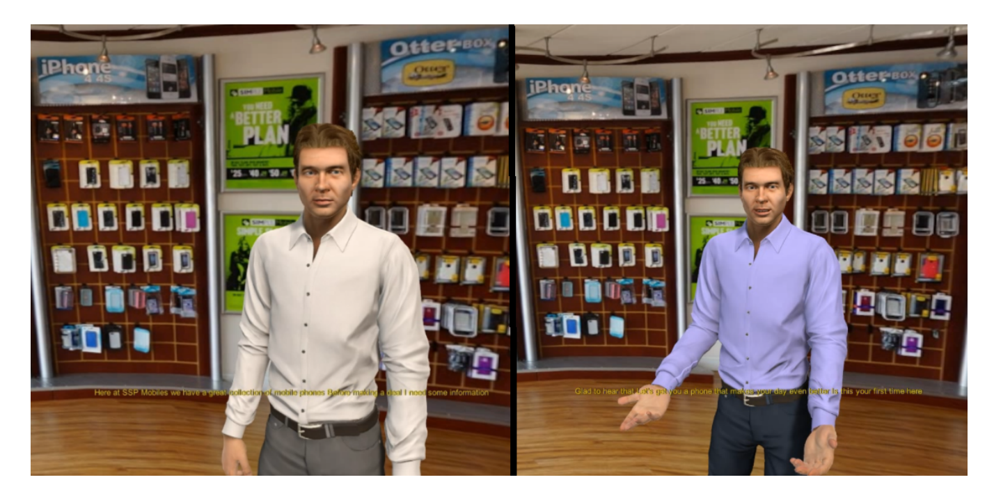
Figure 1: The agent plays the role of a mobile stores salesman. The cold version is on the left, the warm version is on the right.

was programmed to frequently change his direction of gaze during the conversation.