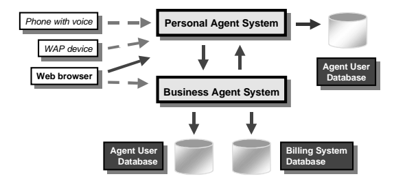
Fig. 1. The Multi-Agent System Functionality

Multi-agent technology supports the development of distributed systems consisting of heterogeneous components that by interacting produce the overall service required [2], [4]. The nature of the domain requires that the MOBIE system consists of heterogeneous components. It should at least consist of a personal agent system, a business agent system, and a number of databases. The databases are needed to store information on the users of the personal agent system and to store information on the consumers but now from the perspective of the business, and there is a billing system database; see Figure 1. The last two of these are already in use by the business, a good reason to keep them as separate entities.