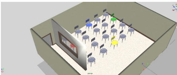
Figure 1: Overview of the virtual classroom.

navigation is done automatically by the software as the project leader presses function keys. Also the questions about the preference of chairs to sit in are given automatically by the software with synthetic voice. The classroom and the interaction are modelled with Maya and played interactively with Vizard. The HMD used is an eMagin Z800 3Dvisor.