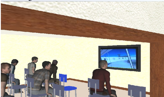
Figure 2: View through the window in the room divider wall.