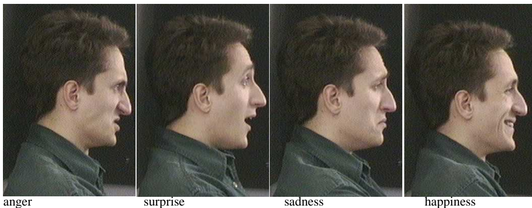
Figure 1. Pictures with emotional expressions

The binarized image of a face was scanned horizontally in order to locate the profile of the face.