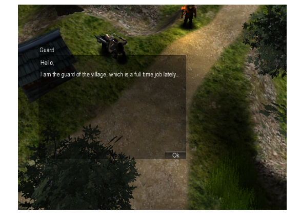
Fig. 1. Screenshot from the RPG implementation

Classical RPGs involve a storyline with quests in which the player character can interact with various friendly characters but also fight or compete against enemies. RPGs have the potential for an infinite variety of stories and situations, including NPC character