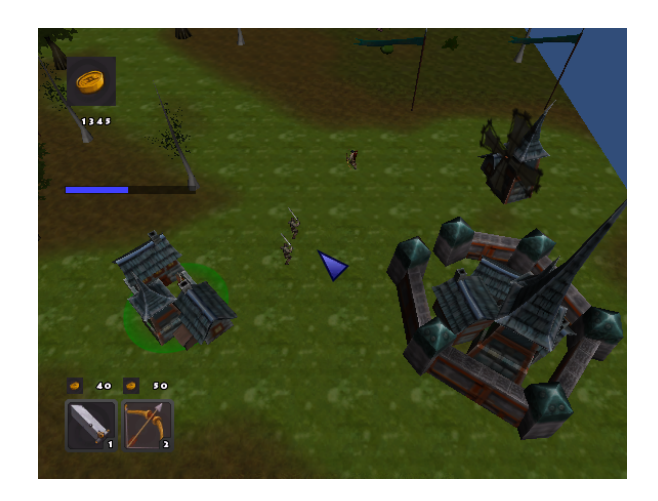
Fig. 2. Screenshot from the RTS implementation

gratitude from Alice, without having to script all these possibilities explicitly.